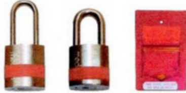
MPL-1 MPL-2 MKS