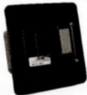
5000HR Recessed Mounted - Hinged Door