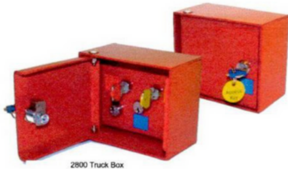
2800 Truck Box