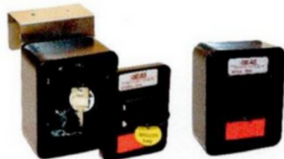
2500 DH Door Hung Mounted 2500 Surface Mounted