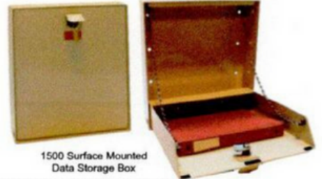
1500 Surface Mounted Data Storage Box