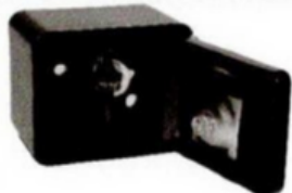
5000H Surface Mounted - Hinged Door